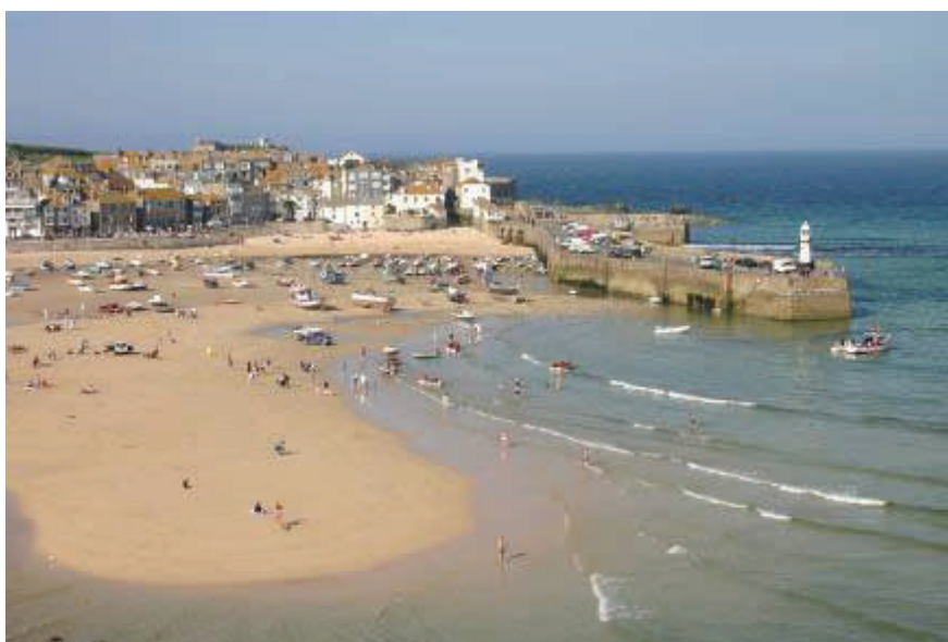
The beauty of St Ives

There will be other trips on offer throughout the next year, so keep your eyes and ears peeled for more info...!