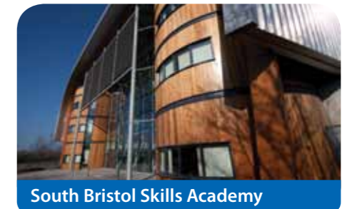
South Bristol Skills Academy