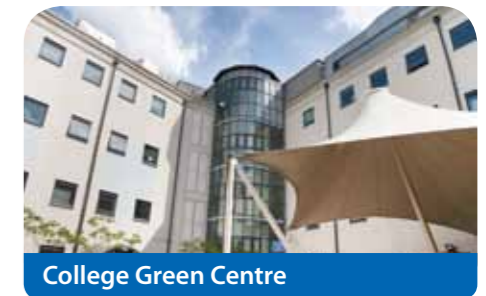
College Green Centre